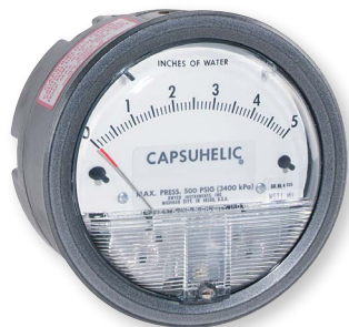
Capsuhelic® pressure gage has a large, easy-to-read 4" (102 mm) dial.