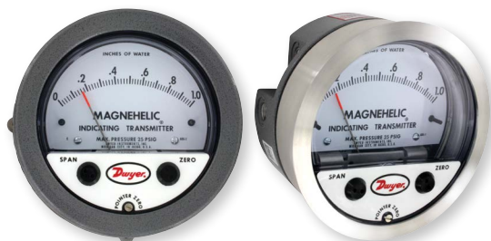
Shown with optional -SS bezel Backward compatible* with Magnehelic® gage